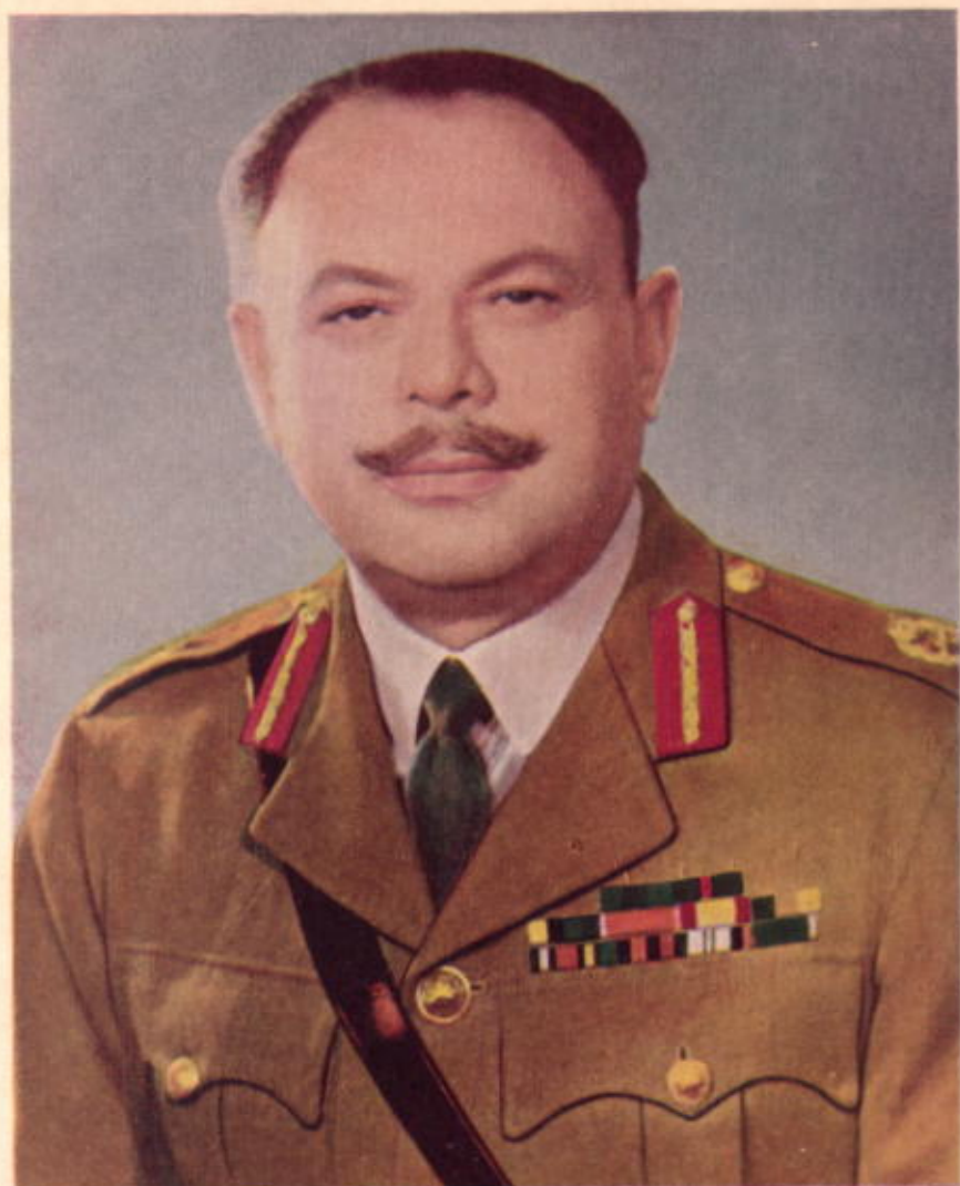
Field Marshal Mohammad Ayub Khan, N.Pk., H.J. President of Pakistan.