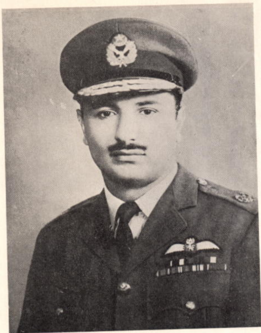
Air Marshal M. Asghar Khan Commander-in-Chief Pakistan Air Force