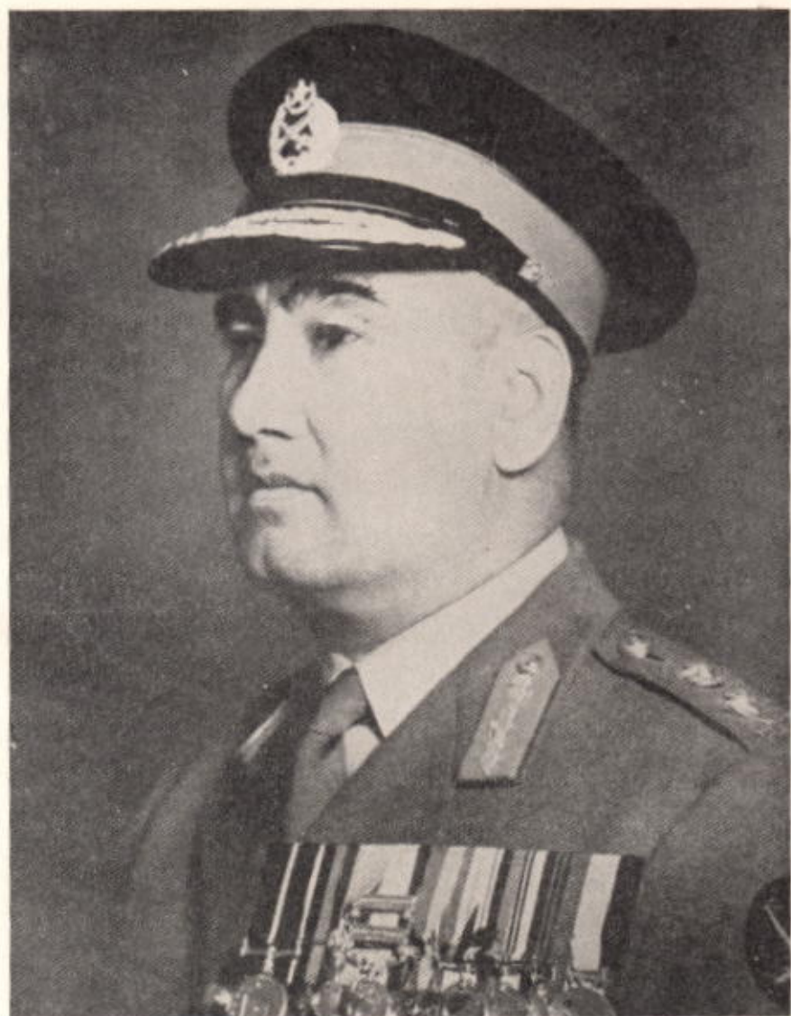
General Muhammad Musa Commander-in-Chief, Pakistan Army.